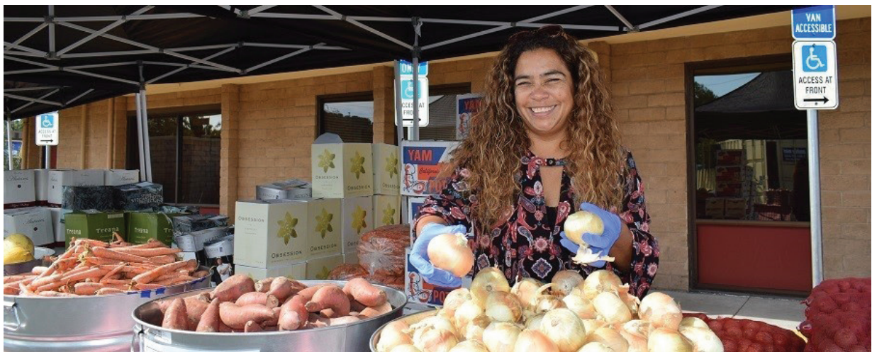
Marin Community Clinics in Novato, California hosts weekly “Health Hubs” where they provide free bilingual services to their community, such as health screenings, nutrition education, Zumba classes, as well as food distribution.

While health care organizations may not always be expert in addressing social needs, they are well-placed to witness the impact of social risk factors that remain unaddressed and are great gateways to receive and then refer patients to resources to meet their needs.