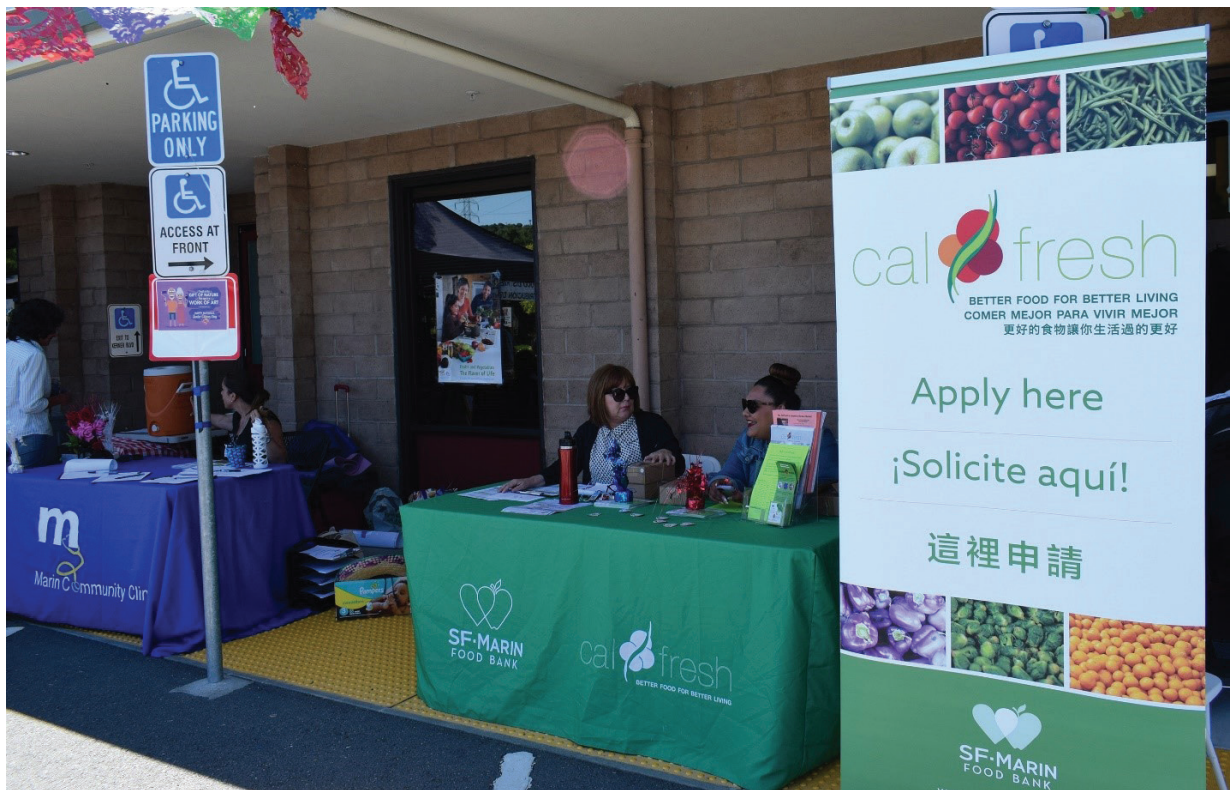
Marin Community Clinics in Novato, California partners with CalFresh to help make healthy foods affordable for their community. CalFresh and other community partners set up booths at Marin's weekly Health Hubs to bring more awareness about available community resources and services.

EXAMPLE: Health center and Primary Care Associations in different states have partnered with organizations interested in sub-populations such as state chapters of the American Heart Association or organizations focused on the opioid epidemic to work together on addressing social determinants of health that affect these populations. These partnerships can often be a source of funding to do this work.